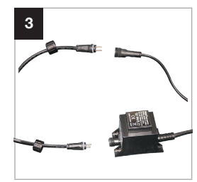
Connect the two ends of the L.E.D. lighting wires together and screw over the plastic collar. Push the cable with two pins into the transformer and screw over the plastic collar.