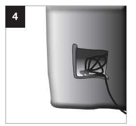
Place the pump and excess wires into the access cavity ensuring that the long pump/L.E.D. wires extend out through the opening. Cover the opening with the trap door.