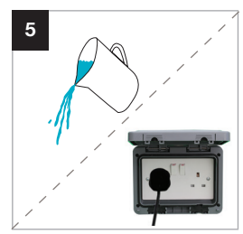
Carefully fill the fountain with sufficient water ensuring the pump is fully submerged. Connect the plug from the transformer to your mains outlet.