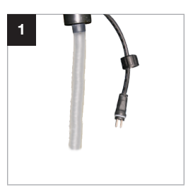
Reach inside the opening in the rear of the fountain pulling out the tubing/water pipe and internal L.E.D. cable(s).