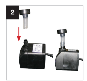
Connect the tubing to the outlet of the pump and place it in the water reservoir through the opening in the rear of the fountain.